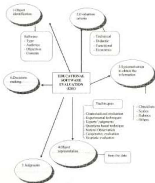
Figure 2. Model for ESE addressed to teachers

Teachers sometimes use educational software even when they are not prepared to use it or to evaluate it. It is important to remember that the use of such a material must be accompanied of a critical revision of it. That's why we show a set of software evaluation techniques and criteria